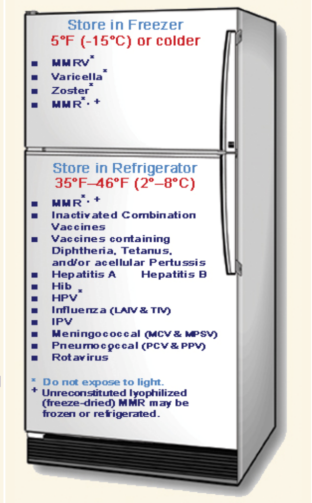
Store each vaccine in its proper location.

Loss of vaccine potency due to improper storage conditions is a costly mistake. Patients receiving vaccine with decreased potency caused by improper storage conditions may not be fully protected against the vaccine-preventable disease. In the General Recommendations on Immunization, the Advisory Committee on Immunization Practices (ACIP) and the American Academy of Family Physicians (AAFP) state that mishandled vaccine doses should not be counted as valid doses and should be repeated unless serologic testing indicates a response to the vaccine.<sup>3</sup> Recalling patients to repeat vaccine doses because vaccine has been stored improperly can damage public confidence in vaccines and in your practice.