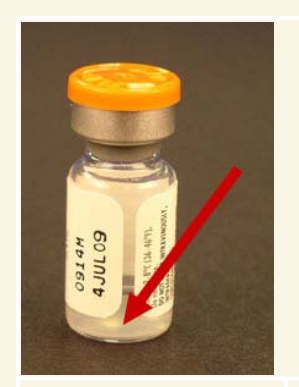
Properly stored vaccine Full Potency

Some vaccines may show physical evidence of altered potency when exposed to inappropriate storage conditions, such as clumping in the solution that does not go away when the vial is shaken. Other vaccines may look perfectly normal when exposed to inappropriate storage conditions. For example, inactivated vaccines exposed to freezing temperatures (i.e., 32°F [0°C] or colder) may not appear frozen and give no indication of loss of potency. Therefore, visual inspection of vaccines is an unreliable method of assuring potency.