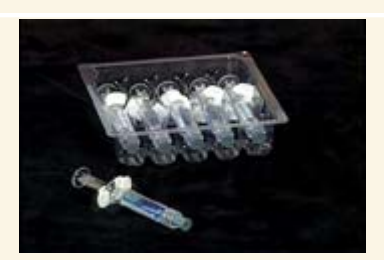
Manufacturer-supplied prefilled glass syringes.

Manufacturer-filled glass syringes are available for a variety of vaccines. NCIRD does not have a preference for specific vaccine brands or product presentations; either vials or manufacturer-filled syringes (when available) are acceptable for use, depending on the preferences of your practice. Manufacturer-filled syringes are an alternative to prefilling syringes yourself. These syringes are prepared under sterile conditions that meet standards for proper handling and