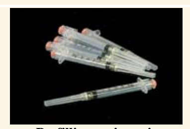
Prefilling syringes is generally discouraged.