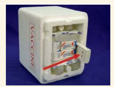
Place a thermometer next to the vaccine but not in contact with the refrigerated/frozen packs.