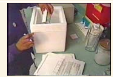
Crosscheck the contents with the packing slip to be sure they match.