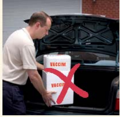
When transporting vaccine in ordinary vehicles use the passenger compartment—not the trunk.