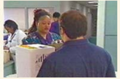
All staff members who accept vaccine deliveries must be aware of the importance of maintaining the cold chain and of the need to immediately notify the vaccine coordinator or backup person upon arrival.