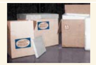
Use properly insulated containers to transport vaccine.

1. Use properly insulated containers to transport vaccine. These containers should be validated to ensure that they are capable of maintaining the vaccine at the correct temperatures. You may use the shipping containers the vaccines arrived in from the manufacturer. Alternatively, you may use hard-sided plastic insulated containers or Styrofoam™ coolers with at least 2-inch thick walls.